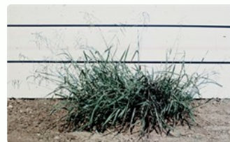
Perennial grass with clustered shoots arising from short rhizomes