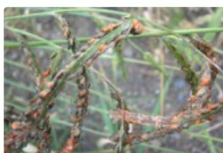
Seed production often severely reduced by the ergot fungus ( Claviceps paspali )