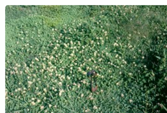
With white clover, southeast Queensland Australia