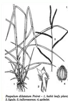
Paspalum dilatatum Poir. - 1. habit leafy plant; 2. ligule; 3. inflorescence; 4. spikelet.