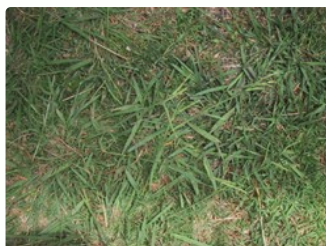
Prostrate habit under mowing