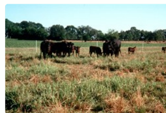
Not well eaten when mature, southern USA