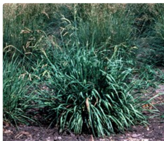
Foliage largely basal, mostly 20-50cm tall

English: bastard millet grass, caterpillar grass, dallis grass, golden crown grass, large waterseed paspalum, paspalum, water grass