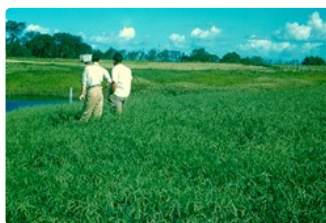
Historically, the earliest sown warm season grass in the humid subtropics (1890s), SE Qld, Australia